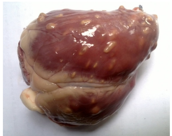
Plate 2: Pig's heart with metacestodes

Tongue palpation in which the pigs are considered positive for infection if cyst-like nodules are either seen or felt on palpation, have been used in several studies to establish prevalence, but this method, though highly sensitive, has comparatively lower sensitivity, which is not always desirable (Gonzalez, 1990; de Aluja et al. , 2008). The result in this study agrees with the above point as pigs were inspected by tongue palpation by the butchers before purchasing.