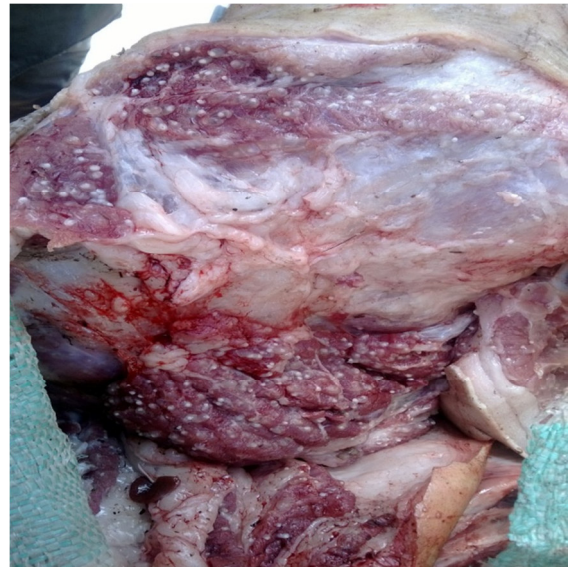
Plate 1: Muscles of pig's armpit with metacestodes

Taenia solium metacestodes were only found in the heart, muscles (Plates 1 & 2) and tongue, with only a single case of infection of the intestinal wall. This may be an indication that the above sites are the major predilection sites of the parasite. This further makes it difficult for ante-mortem inspection of cysticercosis. There was no significant difference between the prevalence of cysticercosis across the different age groups. This may be because; younger pigs are usually active and may easily be infected, as well as older pigs. It may however, be due to the fact that the number of younger pigs that were slaughtered was higher than older ones.